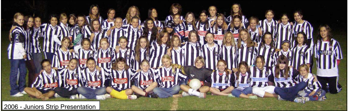
2006 - Juniors Strip Presentation

This year Adelaide City Women's Football Club will be celebrating 10 years on Hutt Street. Throughout this years newsletters we will be explaining the history of Adelaide City WFC and the success it has had since its inception in 1997 and also the developments the club has made since moving to our home grounds on Hutt Street.