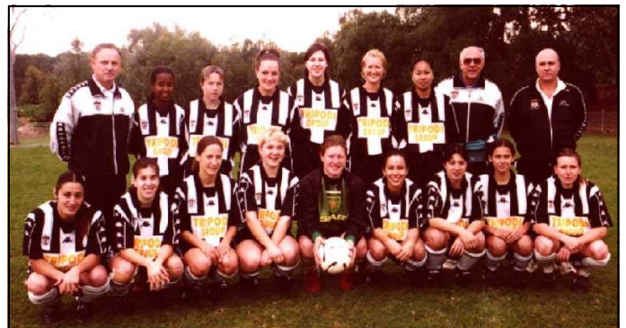
1999 - Our First Premier League