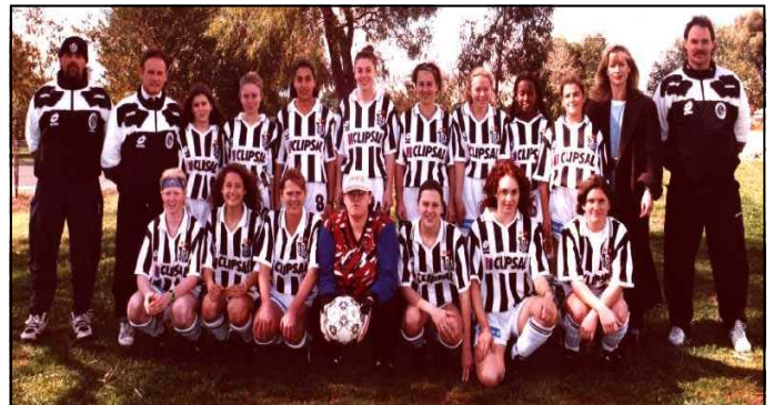
1997 - Division 3 - 1st Team EVER!!